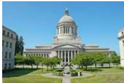
Capitol Building in Olympia