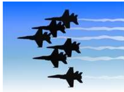
Blue Angels airshow