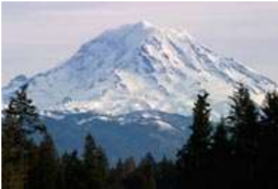
Mt Rainier National Park

These are out-of-town trips around the Puget Sound.