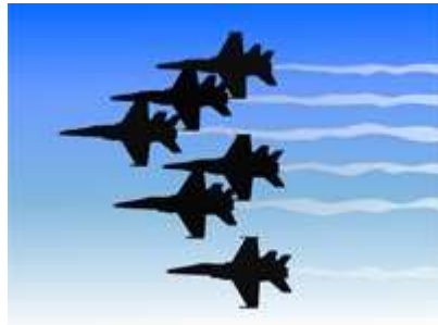
Blue Angels airshow