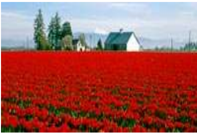
Skagit Valley Tulip Festival